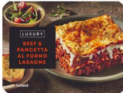
LUXURY BEEF & PANCETTA LASAGNE 838 kcal