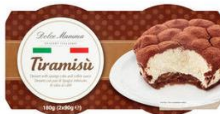
ICELAND TIRAMISU 250 kcal per pot