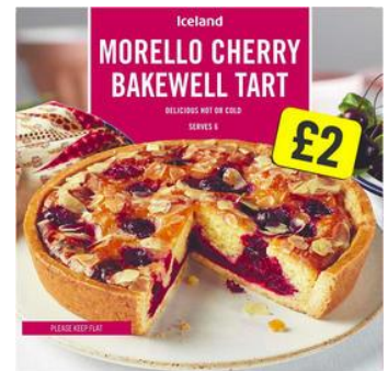
MORELLO CHERRY BAKEWELL TART 238 kcal per 1/6