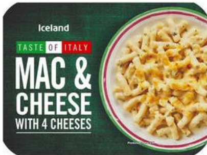
ICELAND MAC & CHEESE 655 kcal