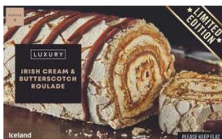
ICELAND LUXURY IRISH CREAM & BUTTERSCOTCH ROULADE 268 kcal per 1/6