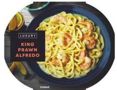
ICELAND LUXURY KING PRAWN ALFREDO 620 kcal